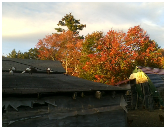
Turkeys and fall foliage

For more information, please visit their website at https://mipnh.org/ or contact Ed Kerman.